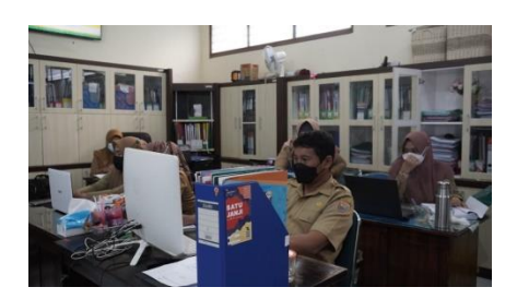
Figure 1.2 The production process carried out at the Batang Regency Diskominfo office while still adhering to health protocols

In the production of Public Service Advertisements, they used several processes. They are preproduction, production, and post-production. During pre-production, the Department of Communication and Informatic of Batang Regency did planning by looking for ideas for making story scenarios. They produce the best idea. In the search for ideas, all members of the IKP sector took part in providing ideas and preparing plans, such as finding shooting locations and preparing equipment before production.