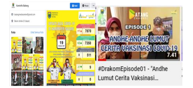
Figure 2. Facebook and Youtube content posts @kominfobatang

Social media is a medium that allows everyone to interact and socialize and communicate without being hindered by space and time. Social media invites anyone to participate by contributing and giving feedback freely, openly, giving comments, and sharing information in a fast and unlimited time. Social media followed the emergence of the internet with the development of information technology. Nowadays, everyone needs information to support their activities, so they try to access information as quickly as possible (Kaplan, et al 2010).