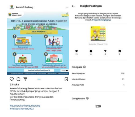
Figure 1. Posts and Insights for Instagram Account @Kominfobatang

Social media, which is now very popular among the public in various clusters, is considered the most appropriate media chosen by Kominfo Batang to promote the prevention and eradication of Covid 19. However, apart from using social media, Diskominfo utilizes various content through conventional media such as radio and news. Currently, Instagram, Facebook, and Youtube are the most popular social media in Batang Regency.