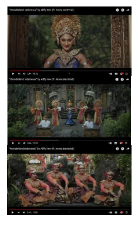
Figure 9. Scene 8 with a duration of 02:43 - 02:51

Reality Level: Scene 8 shows Balinese culture, the clothes used are Balinese clothes with complete accessories that have been modified. In this scene, the background of the temple entrance is used. This is to strengthen the value of the scene.