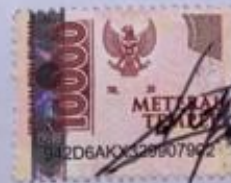
Syifa Rafifah Fauziyah