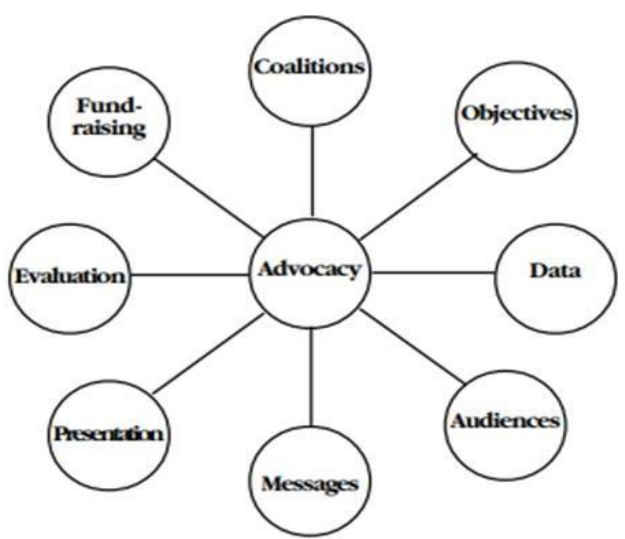
Figure 1.1 Advocacy Elements