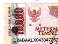
Daeng Prasetyo Prawes