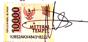
Fitriah Islamiah Askhari