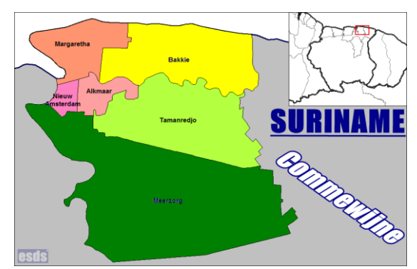
(Figure 2.(Map of Commewijne District, Suriname., nd))

Nowadays, more and more local governments wish to establish cooperative relations in the form of sister provinces/states/prefectures and sister cities at home and abroad. Transnational relations have been established between Indonesia and Suriname since the arrival of Javanese immigrants to Suriname in 1890. The two countries maintain cultural relations, and to improve these relations, Indonesia opened a Commissioner's Office in 1951 and upgraded it to a Consulate General in 1964. Bilateral relations between the two countries were officially marked by the opening of the Embassy of the Republic of Indonesia in Paramaribo on January 23, 1976. Seeing from this experience the Yogyakarta city government agreed on sister city cooperation with the Commewijne district. The signing of the MoU on cooperation was officially signed on April 4_2011 at the Paramaribo Commewijne district office as a follow-up to the letter of intent (LoI) which was agreed on November 11, 2009.