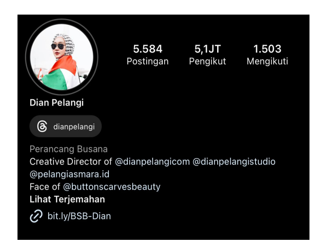
Figure 1. 2 Figure from: Instagram @dianpelangi

that they have bought and received satisfaction. This can happen not only because of the quality of the product but also because of the influence of communication skills, socialization skills, and creativity possessed by Dian Pelangi. By analyzing the dynamics of this popular Instagram account, this study aims to gain insight into the impact of parasocial relationship involvement on purchase decisions in versatile scale buying Buttonscarves products. The range of substance and interaction that @dianpelangi accounts with makes it an ideal person to explore the relationship between consumer engagement and brand success in the digital age.