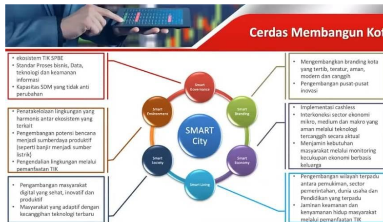
Figure 1. 1 Smart City Component

Smart mobility is the management of city infrastructure with an integrated management system that is oriented to ensure alignment with the public interest. Smart mobility is a component or dimension of Smart City that focuses on transportation and community mobility. There is a smart transportation and mobility process in smart mobility, so it is hoped that public services for better transportation and mobility will be created, as well as common transportation problems such as traffic jams, traffic violations, pollution, and others.