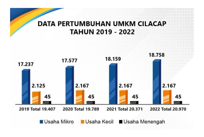
Figure 1.3

Based on the data from the Ministry of Cooperatives and Small and Medium Enterprises (Kemenkop UKM, 2022), the number of MSMEs reached 64.2 million from the number of Large Enterprises of 5,637, Medium Enterprises of 65,465, Small Enterprises of 789,679 and Micro Enterprises of 64,058,201. The figure shows the condition where the majority of MSMEs are still in the Micro Business category with a percentage of 99.97% or more than 64 million business actors.