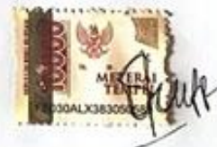
Satria Bagus Pamungkas